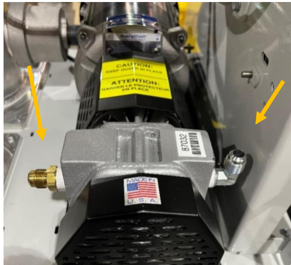
Figure 9-6: Two tubes removed from vacuum pump