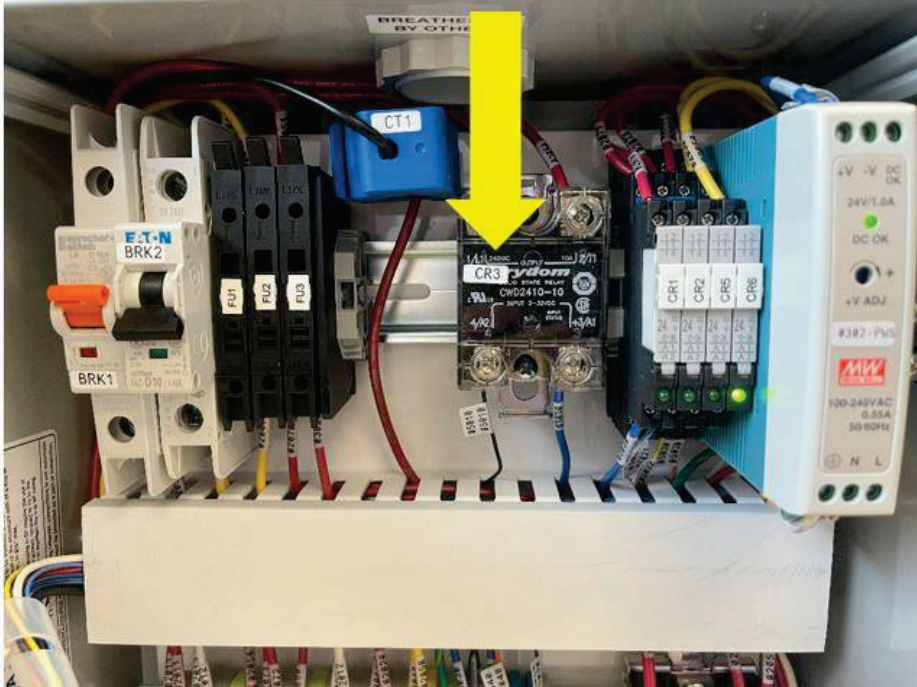
Figure 9-4: Vacuum Pump Solid State Relay

(NOTE: Control Panel Component may not be in the position as shown depending on the Control Panel revision. Always refer to the wire numbers.)