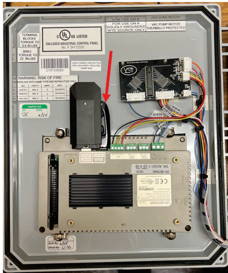
Figure 8-24: USB Drive for Digital (data) Storage