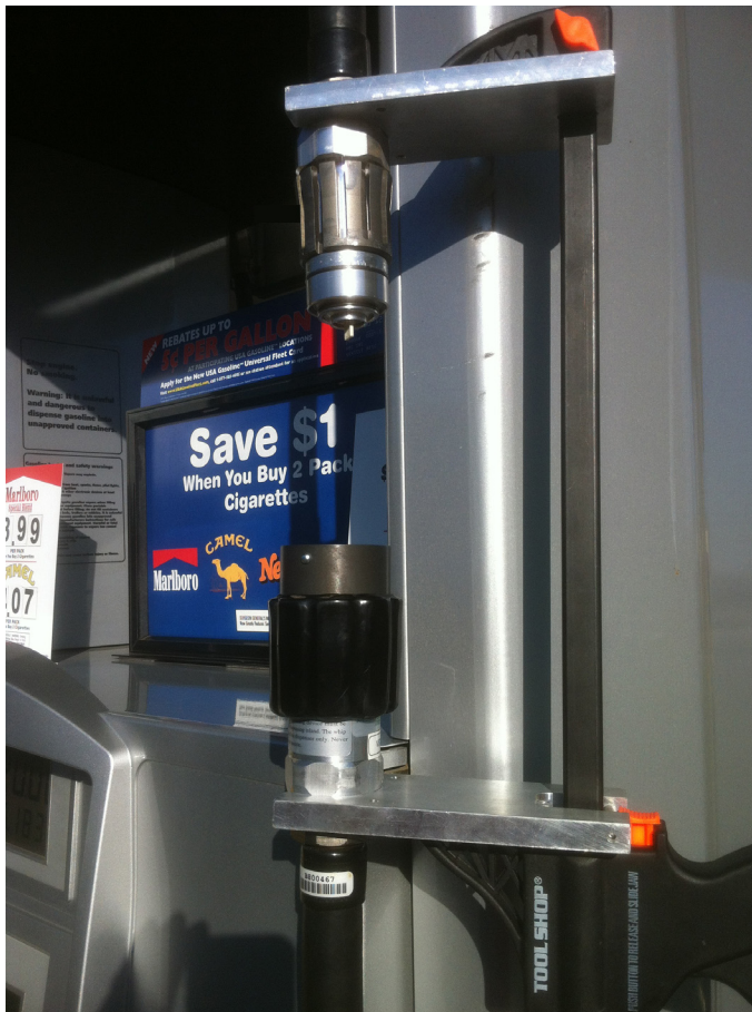
Figure 2. VST Breakaway Assembly Tool