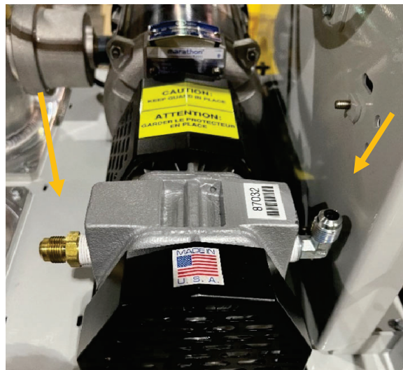
Figure 9-7: Two tubes removed from vacuum pump