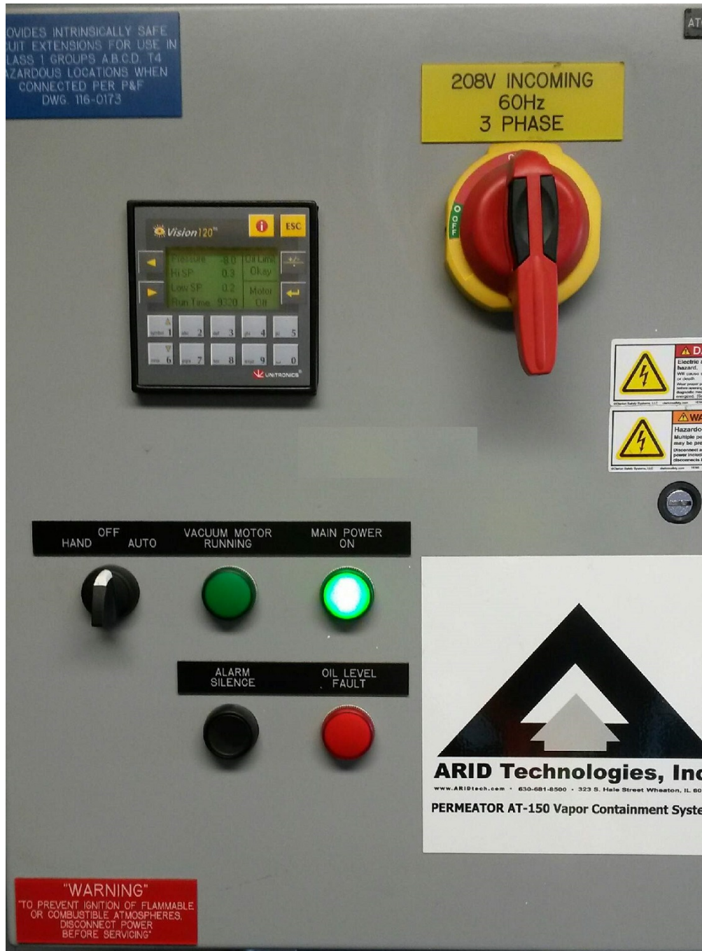
FIGURE 8-2 Configuration of Permeator Control Panel Hand/Off/Auto Control Knob in OFF position to Conduct TP-201.3