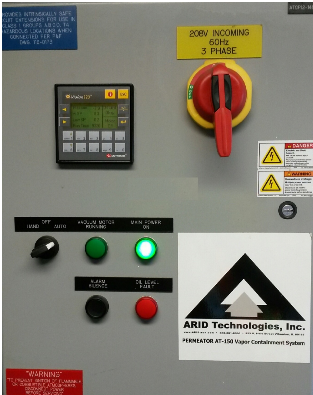
FIGURE 8-3 Configuration of Permeator Control Panel Hand/Off/Auto Control Knob in AUTO position after Conducting TP-201.3