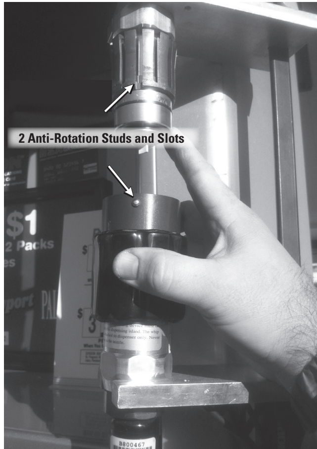
FIGURE 3. Anti-Rotation Studs and Slots