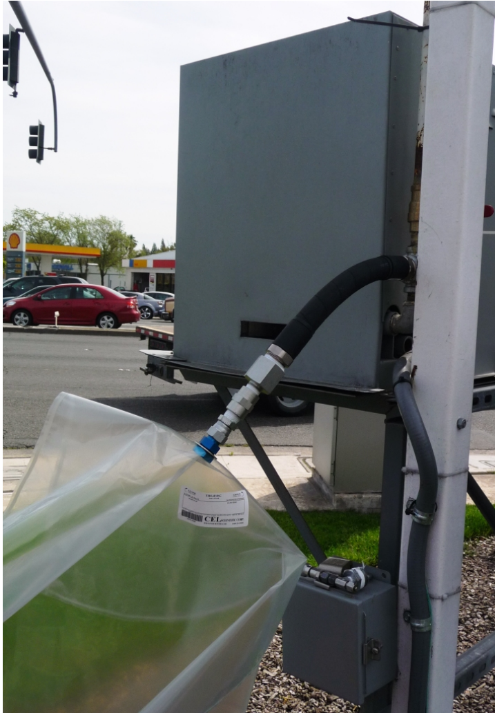
Figure 10: Tedlar Bag attached to Green Machine