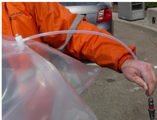
Figure 4: Attach Tedlar Bag to Vacuum Pump to Evacuate the Nitrogen