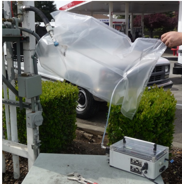
Figure 12: Tedlar Bag attached to the Green Machine and NOVA