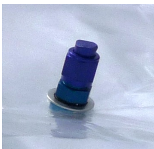
Figure 3: Large Cap with Flare Fitting