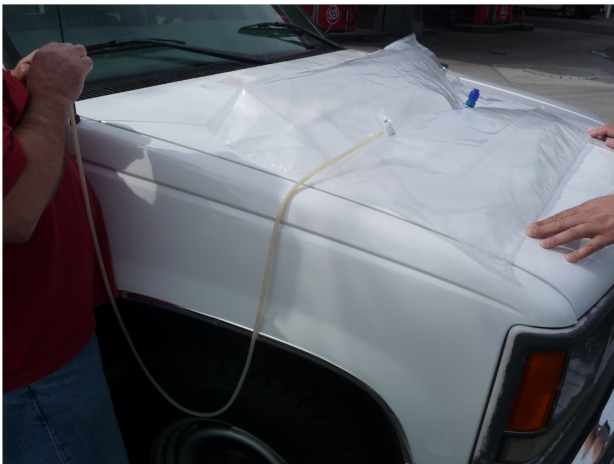
Figure 2: Tedlar Bag Connected to Nitrogen