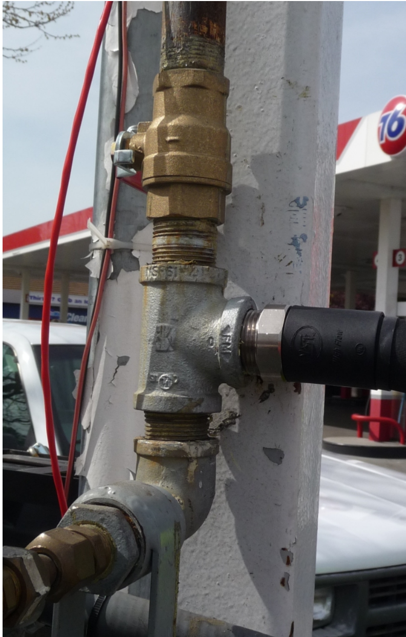
Figure 6: Test Hose on 1" Test Port

4.11 Connect the provided test hose to the pipe tee on the air outlet.