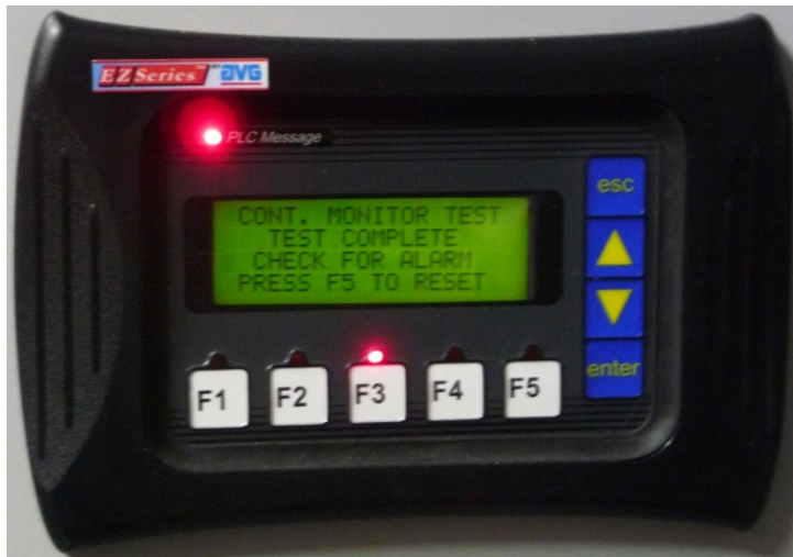
Figure 8: End of Test Message