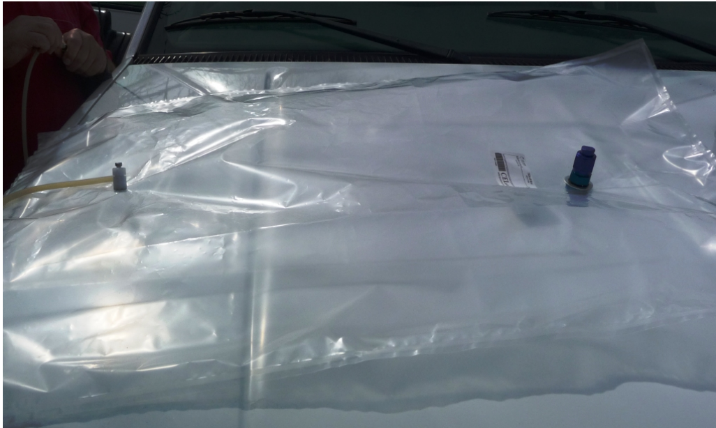
Figure 1: Tedlar Bag with Connections