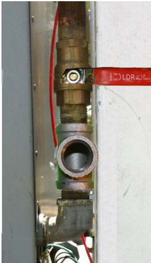
Figure 5: Ball Valve and 1" Plug on Test Port