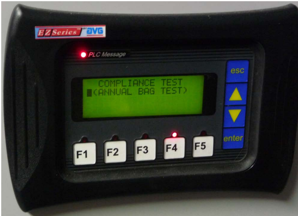
Figure 11: F4 – GM Bag Test