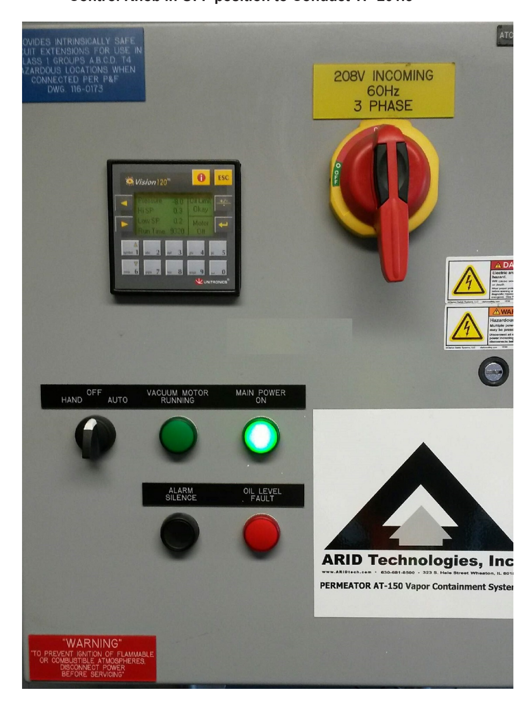
FIGURE 8-2 Configuration of Permeator Control Panel Hand/Off/Auto Control Knob in OFF position to Conduct TP-201.3