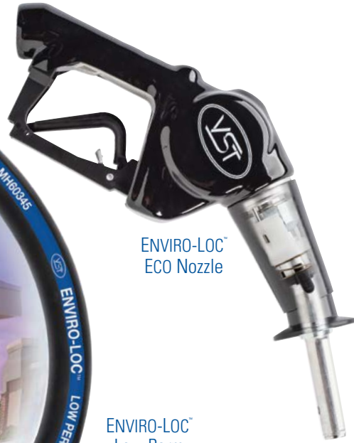
ENVIRO-LOC™ ECO Nozzle