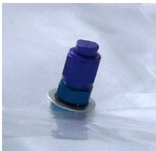
Figure 3: Large Cap with Flare Fitting