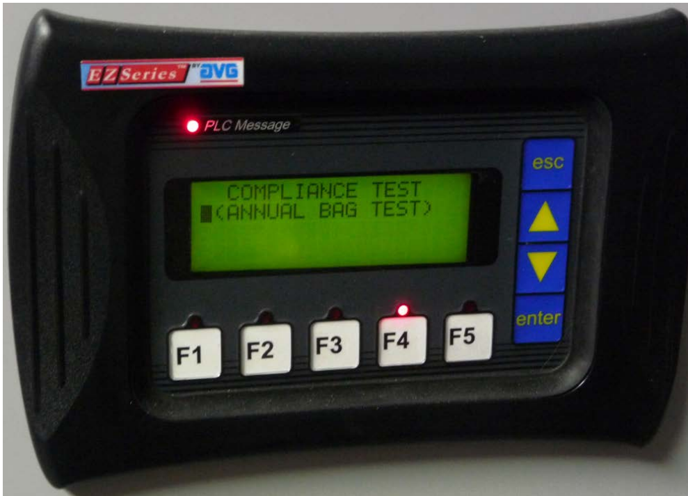
Figure 11: F4 – GM Bag Test