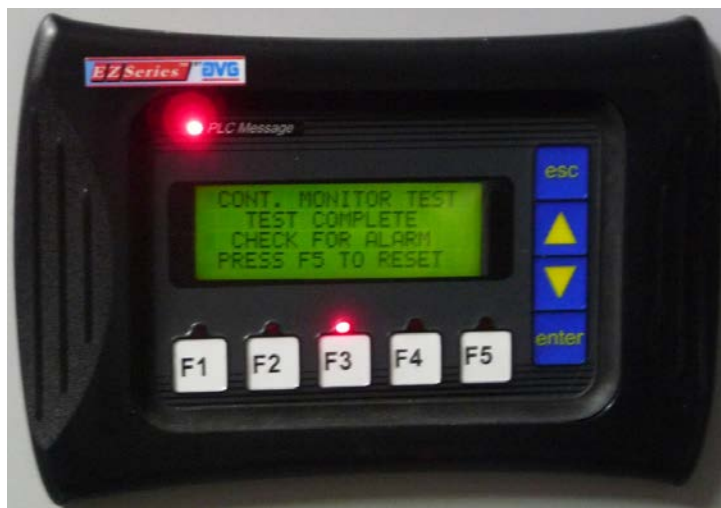
Figure 8: End of Test Message