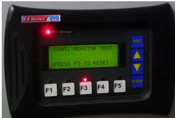
Figure 7: F3 Displays "Cont. Monitor Test"