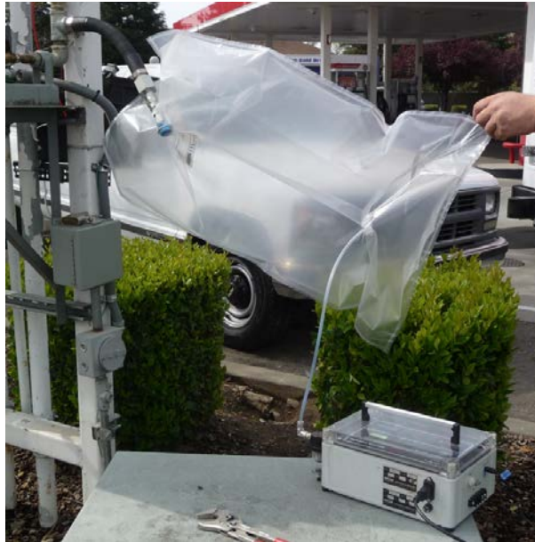
Figure 12: Tedlar Bag attached to the Green Machine and NOVA