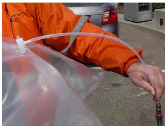
Figure 4: Attach Tedlar Bag to Vacuum Pump to Evacuate the Nitrogen