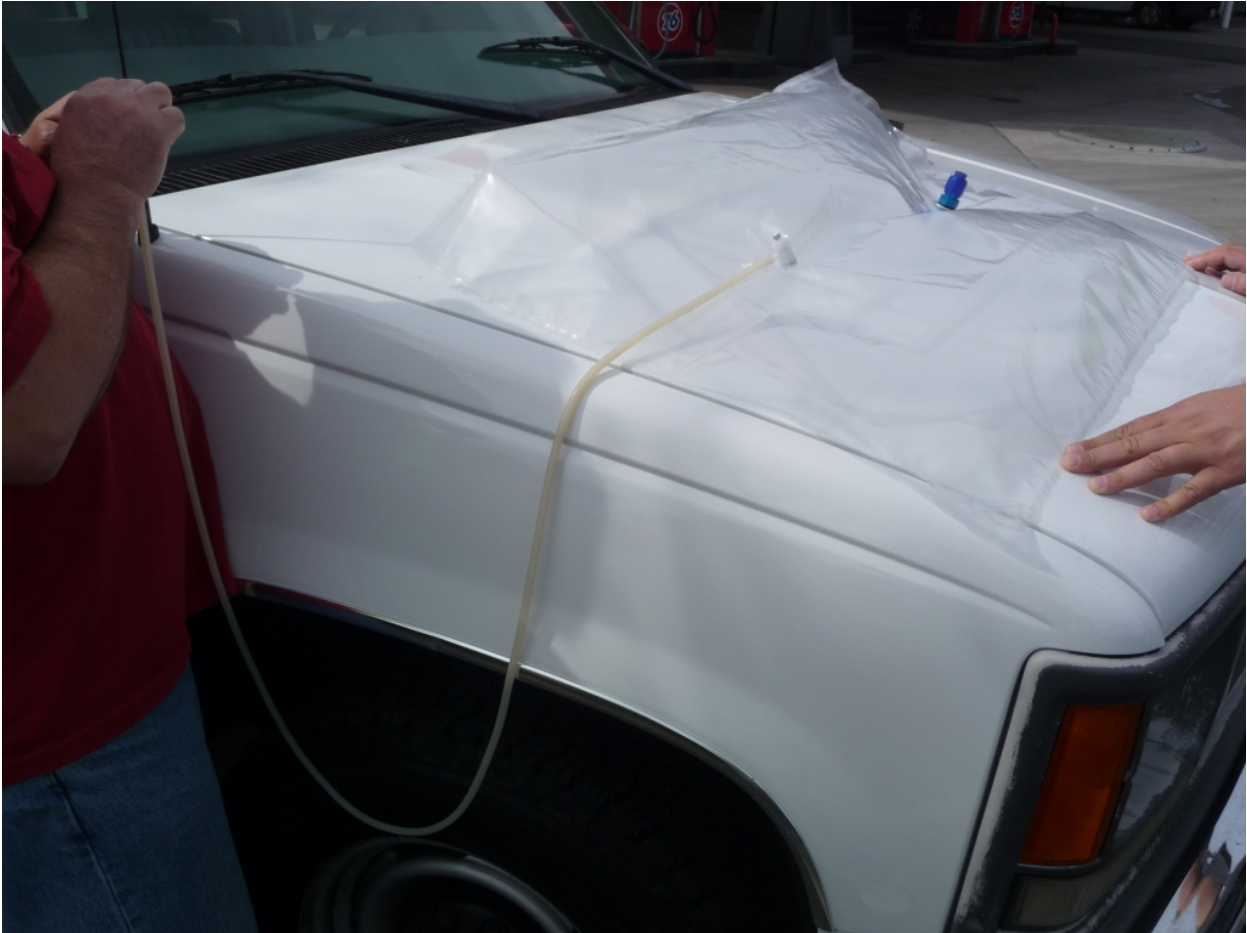
Figure 2: Tedlar Bag Connected to Nitrogen