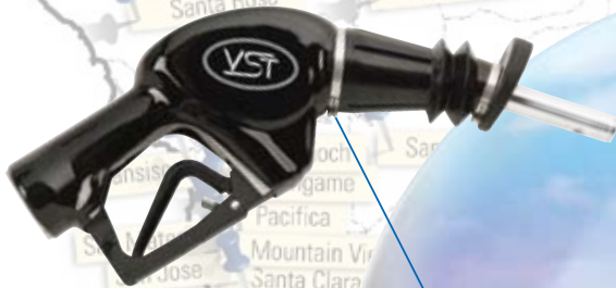
ENVIRO-LOC™ EVR Balance Dripless/Spitless Fuel Nozzles

User-Friendly Enhanced Vapor Recovery. Exactly what you need.