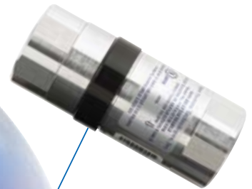
ENVIRO-LOC™ EVR Balance Safety Breakaways