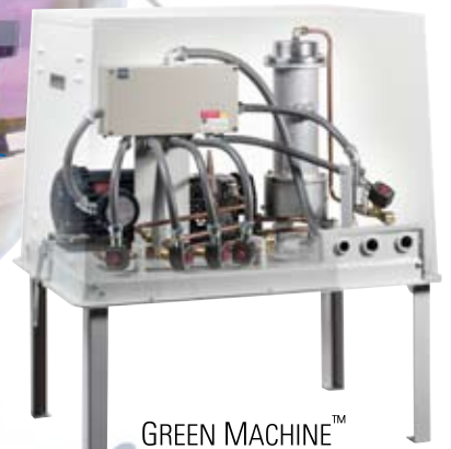
GREEN MACHINE™ UST Tank Pressure Management System