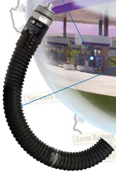
ENVIRO-LOC™ EVR Balance Fuel Hoses