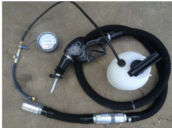
Here is a picture of what I built.

I have created a simple tool to leak test hanging hardware assemblies. I highly recommend a pressure test on hanging hardware after a drive off. On several occasions I have made the mistake of just reconnecting a breakaway and assuming everything was fine. A week later, the site had a vapor leak warning. Doing a quick test of the hanging hardware assembly would have eliminated the return trip. You can use a lawn/garden sprayer if you don't have nitrogen or other pressure source. I use a separated breakaway half with a hole drilled and tapped in the side. Use a magnahelic gauge or manometer to test up to 10inWC. Do not apply pressure above 5 PSI.