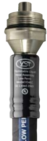
Rigid 1-7/8 – 12 UN (Balance Converter Coupling)