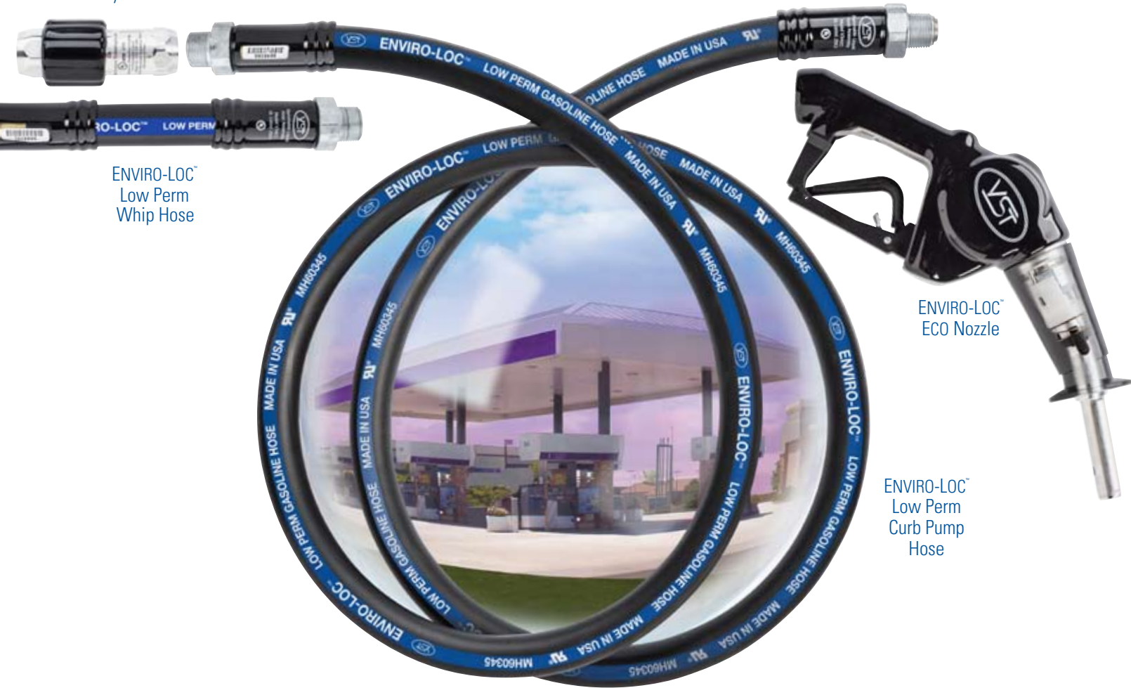
ENVIRO-LOC™ Low Perm Whip Hose